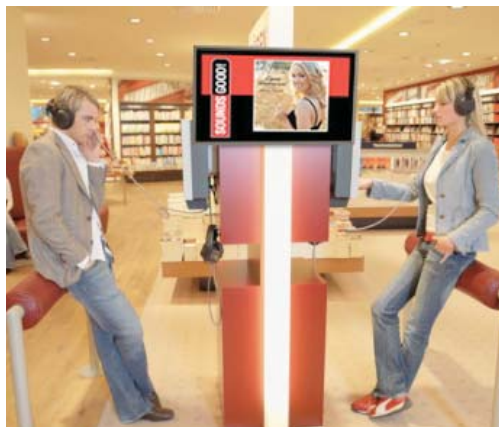
Digital signage attracts 10 times the eye contact that static signs receive.